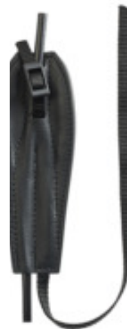
XF V-Grip Hand Strap (Included with V-Grip) Part # 71061