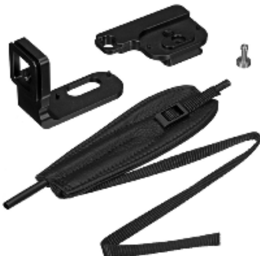
L-Bracket for standalone use on XF (Including the leather hand strap) Part # 71059