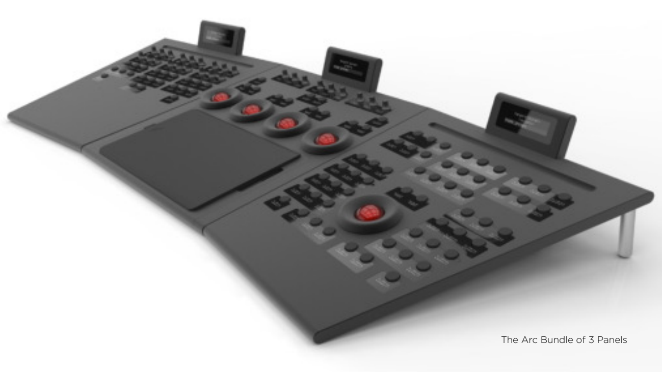
The Arc Bundle of 3 Panels

Tangent solutions are available from www.tangentwave.co.uk