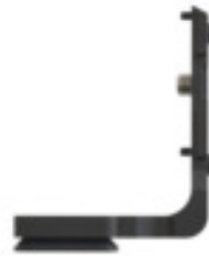
XF Quick release L-Bracket with portrait mount for V-Grip (Included with V-Grip) Part # 73171