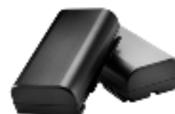
XF/IQ battery Li-ion 7,2V 3400mAh, 2 Pcs Part# 70518