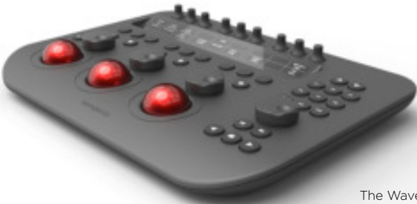
The Wave2 Panel