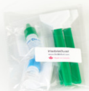
Visible Dust Cleaning Kit Part# 76002500