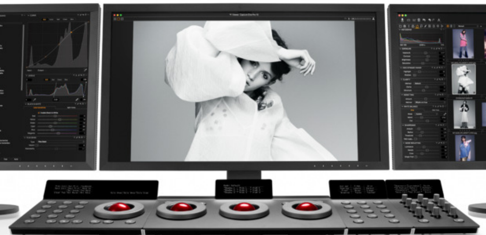
The Element Bundle of four panels (Tk, Mf, Kb & Bt panels)