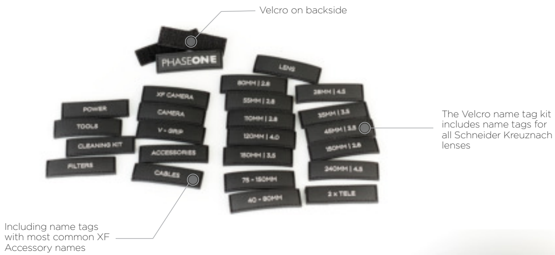
60900127 Phase One Velcro Name tags

Velcro tags can be used to identify lenses when packed in a lens wrap