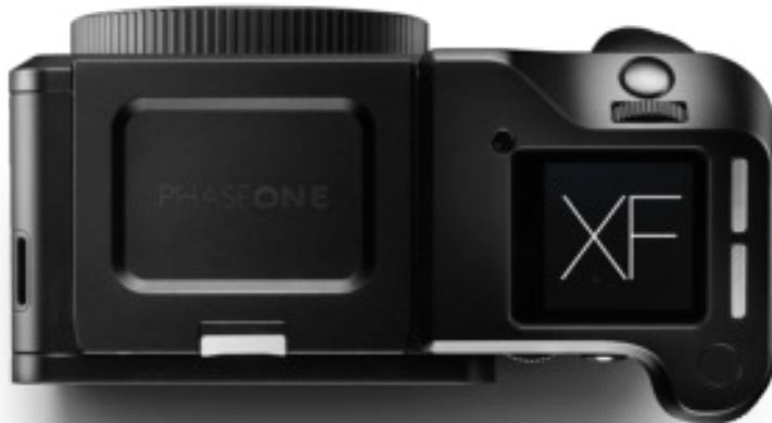
XF Camera Body Part # 73088

Expanding the versatility with specialized quality hardware