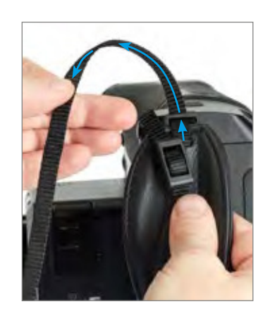
Thread the loose end of the strap through the top hand strap mount on the V-Grip. Make sure that you thread it through the bottom opening first and out through the top opening. Take the strap and turn it towards you, being sure not to twist it.