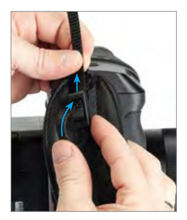
In order to secure the hand strap as much as possible, thread the strap back through the top end of the buckle and then pull to fasten it.