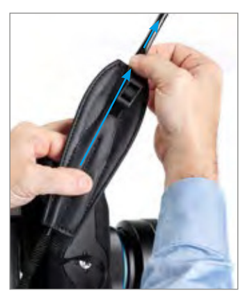
Hold onto the hand strap with one hand, and gently pull the tube all the way out through the hand strap channel. Remove the pin from the tube and remove the tube from the strap. Next, pull the strap all the way out until the hand strap is tightened against the bottom of the V-Grip.