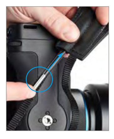
Push the supplied pin into the tube in order to make sure that the strap is attached firmly to the tube. This step is important to ensure that the strap can be guided from one end of the hand strap channel to the other.