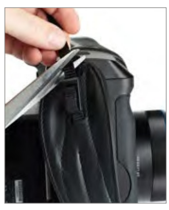
Using scissors, cut the remaining end of the strap and, to prevent unraveling, burn the tip of the nylon strap in order to seal the end.