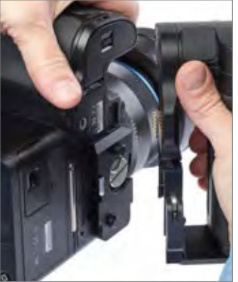
Make sure that the quick release on the V-Grip is open. The latch should point 90 degrees out from the grip. Place the V-Grip on the bracket on the XF camera body so it aligns with the XF hand grip and the contact pins integrates well into the connector recession.