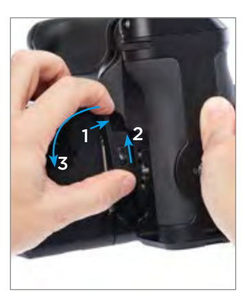
To remove the V-Grip, first press the top of the quick release hatch towards the front (1) Then push the quick release safety switch towards the top of the grip with your thumb. (2) Then use your index finger to flip the quick release latch 90 degrees out from the V-Grip. Remove the V-Grip.