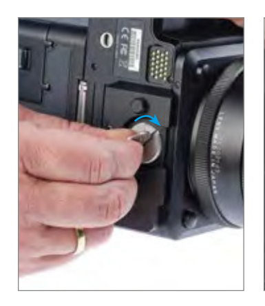
Use the supplied disc or a coin to securely fasten the quick release adapter or L-Bracket, turning it clockwise.