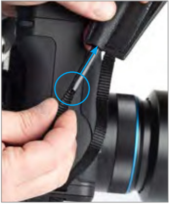
Fold the tip of the strap as shown, and push it into the end of the tube that will then be inserted through the hand strap. Push the thread to approximately the point where the tube meets the hand strap. Make sure that the strap is not twisted while you complete this step.