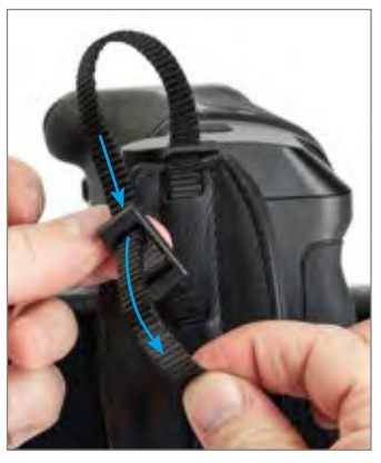
Thread the strap through the top end of the buckle and then pull it until the hand strap is tightened to the V-Grip. Thread the strap through the bottom opening of the buckle and pull it all the way to tighten the strap.