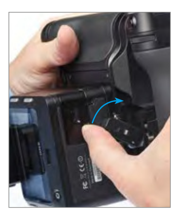
Press the V-Grip against the XF camera and turn the quick release latch 90 degrees up in order to lock the V-Grip securely into place. Please make sure that the safety switch locks correctly with a tactile click.